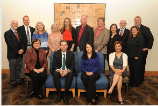
ASN Board of Directors 2015-2016